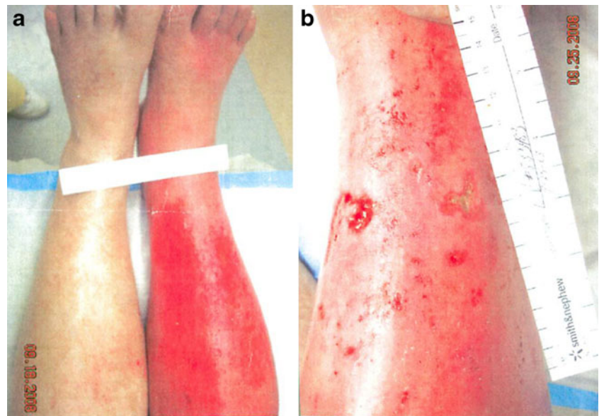
Fig. 1 Advanced CRPS symptoms in Case 1. 4.5 years after onset of the disorder. a Allodynia and pronounced vasomotor dysfunction are present in the lower right extremity (photo taken 9/18/2008). b One week later, the leg has developed numerous ulcerations

and anti-cardiolipin antibodies. As a result of her EDS, the patient has had repeated dislocations of her right shoulder, as well as her right ankle. The patient first developed CRPS in her lower right extremity in 2008. In 2009, the patient developed dystonic muscle spasms in the upper extremities, which were interpreted by her physicians as evidence of a conversion disorder.