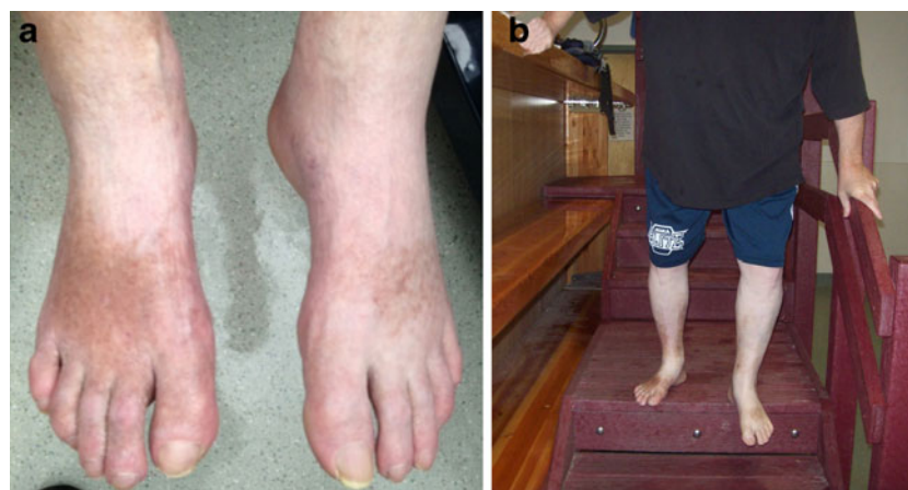
Fig. 2 Case 1. Certain symptoms are attenuated following treatment with low-dose naltrexone (LDN) in a long-standing case of CRPS (6 years after onset). a Allodynia is greatly reduced in both legs after LDN. However, bilateral trophic changes remain in the lower extremities. Slight swelling is present in the distal portion of the right foot.

In June 2011, the patient was started on low dose naltrexone (LDN) of 3 mg once a day and ketamine troches (sublingual) 10 mg on as needed basis. The LDN was increased to 4.5 mg per day, 4 weeks after starting it. LDN was started as a lower dose to gauge tolerability. She tolerated the LDN very well with